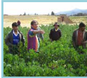
Agriculture Training $100