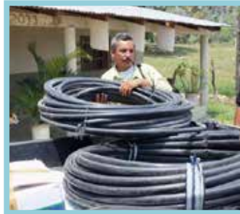
Irrigation Up to $1200