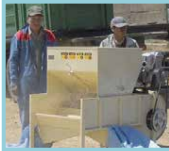
Tools, equipment $100