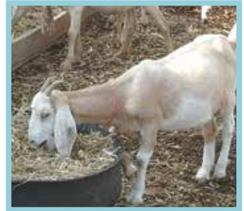
Goat or Sheep Up to $150