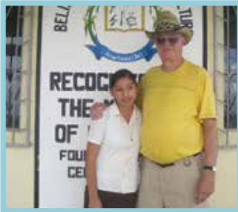
High School Scholarship $300