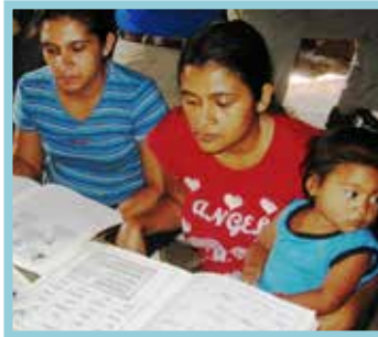
Adult Literacy $100