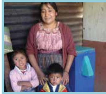
Water Filter $200