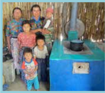
Eco stove Up to $200