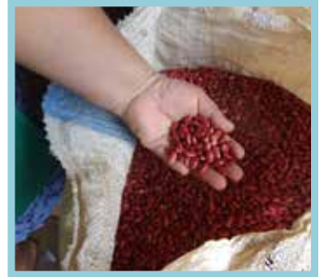
Trees, Seeds $20-$100