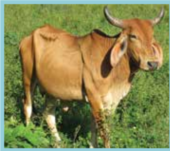
Cow Up to $700

"Never believe that a few caring people can't change the world. For, indeed, that's all who ever have." – Margaret Mead