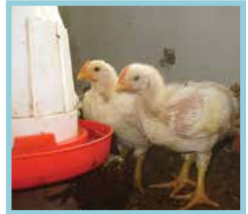
Poultry, rabbits, fish $25