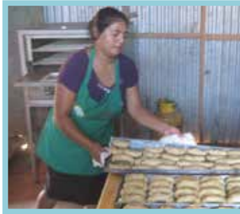
Youth skills training $100